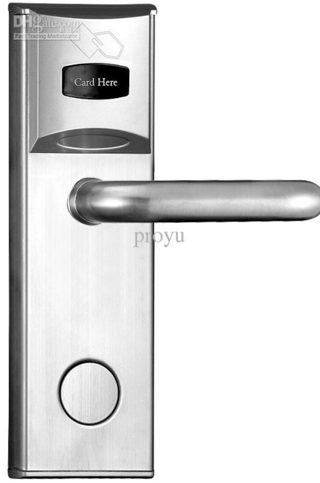
DOOR HANDLE (KNOB)