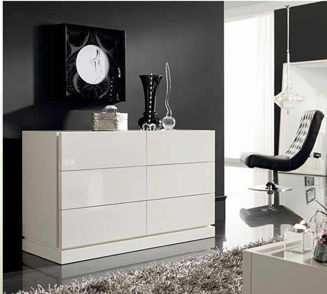
CHEST OF DRAWERS